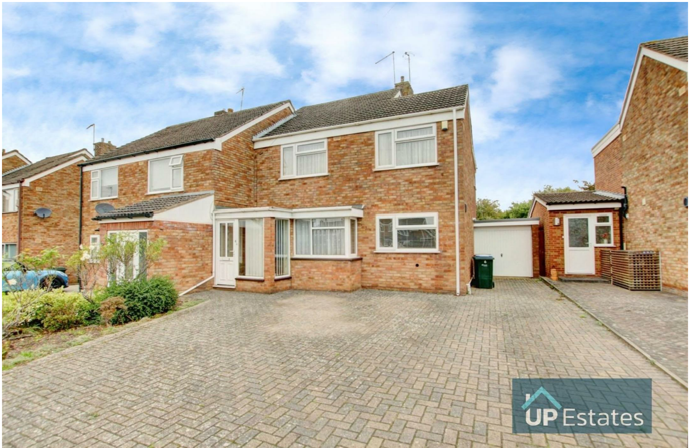
Newby Close, Coventry