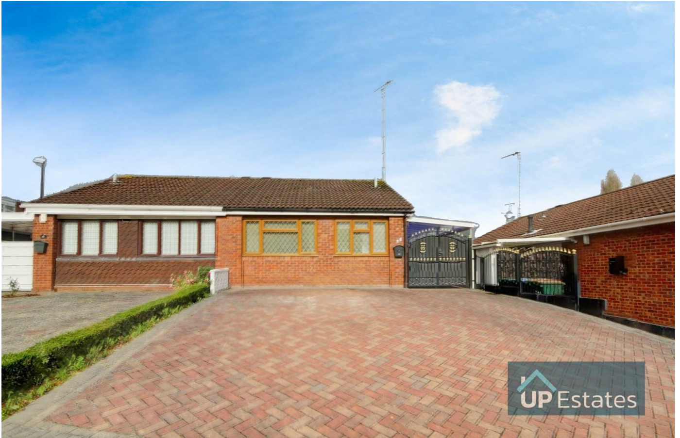
Mantilla Drive, Coventry