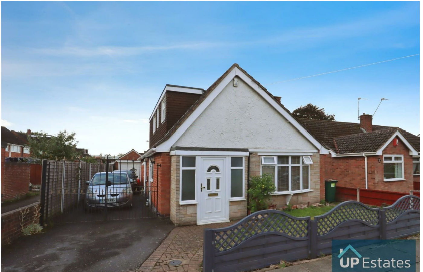
Colina Close, Coventry