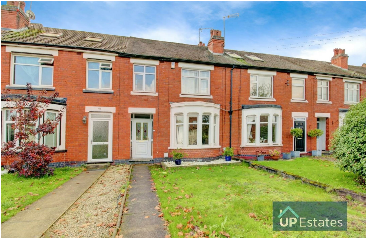
Kenpas Highway, Coventry