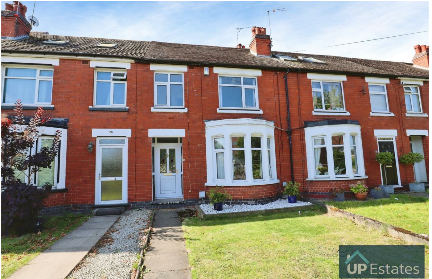
Kenpas Highway, Coventry