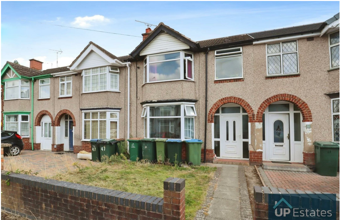
Grenville Avenue, Coventry