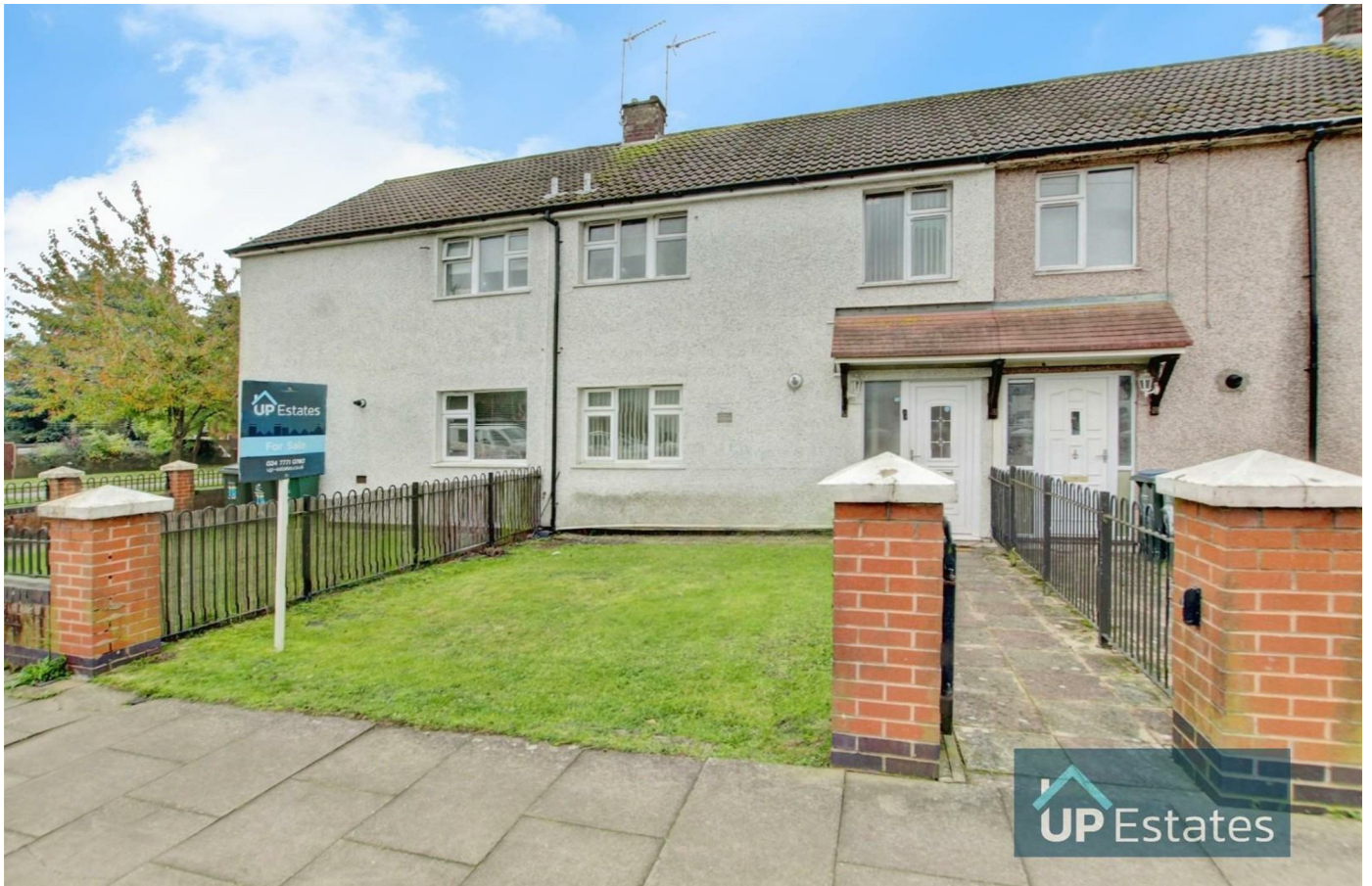
Winston Avenue, Coventry