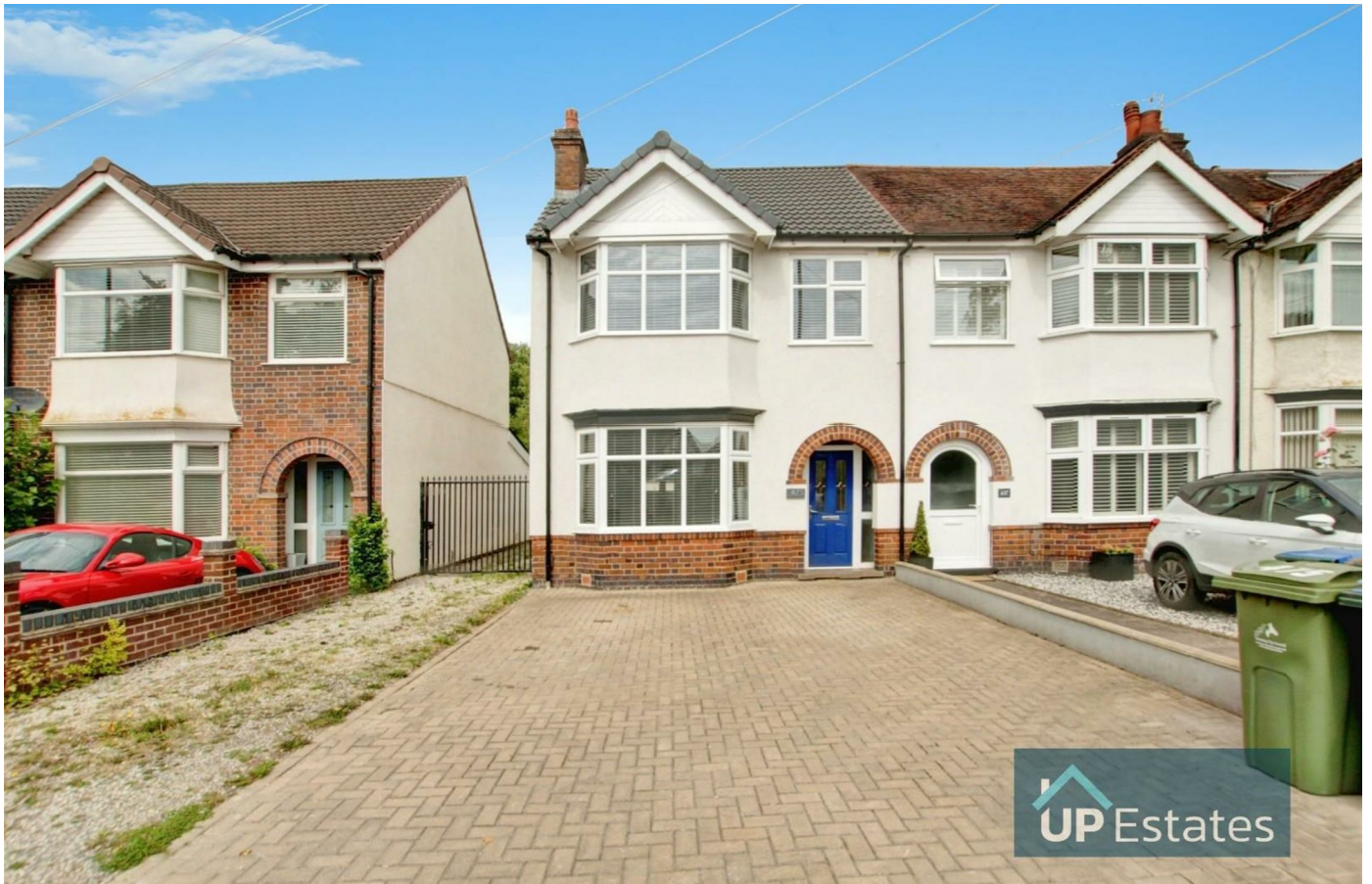
Binley Road, Binley, Coventry