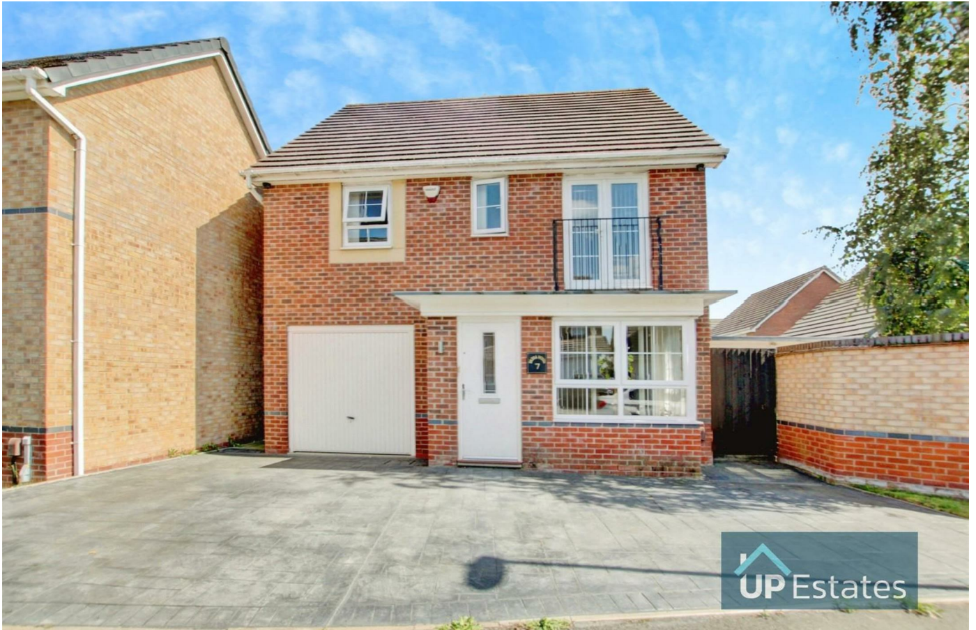
Amelia Crescent, Coventry