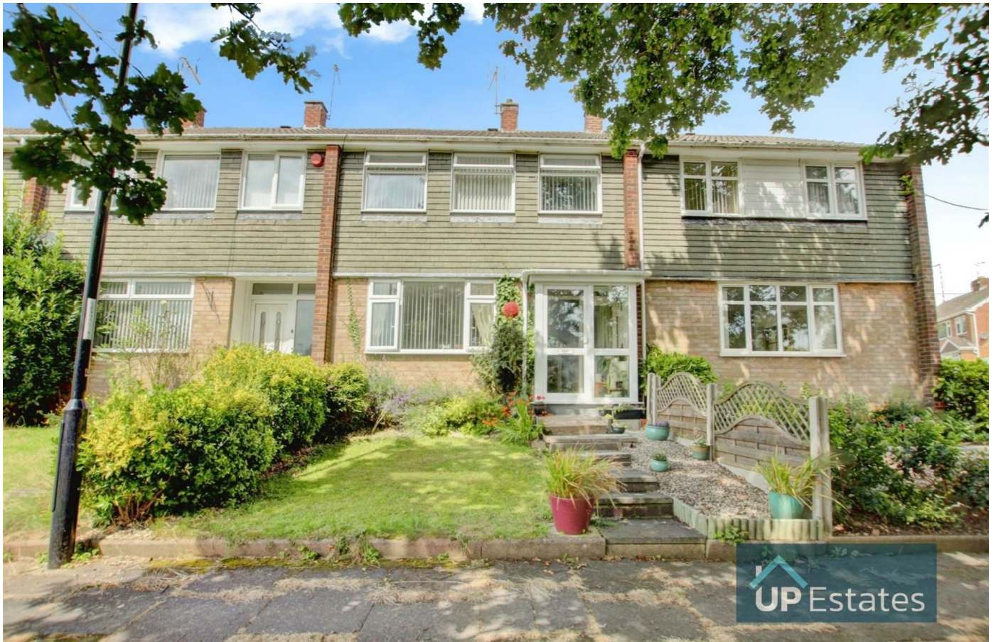
Sutherland Avenue, Coventry