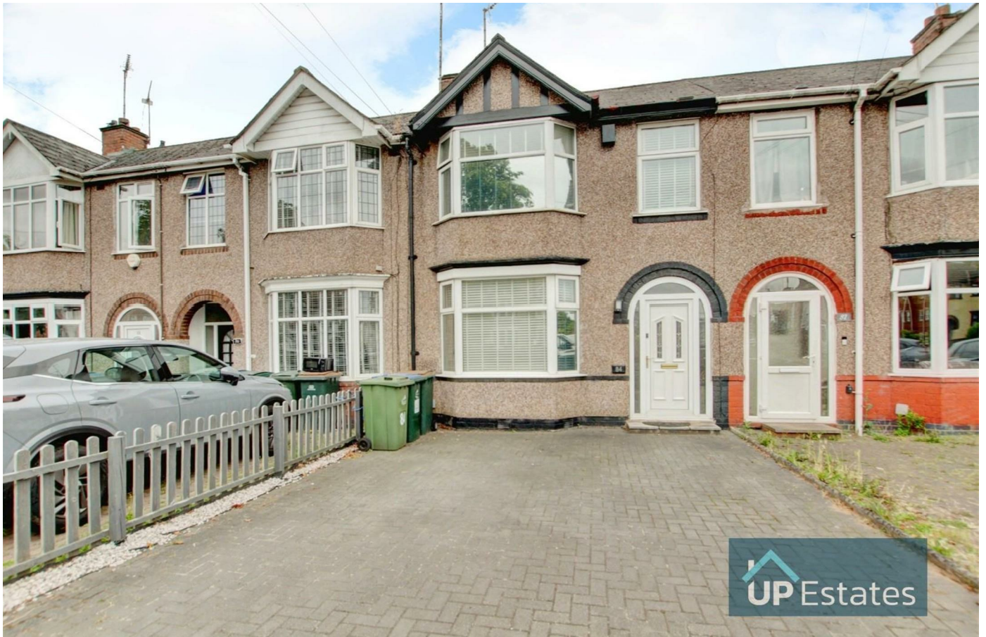
Longfellow Road, Coventry