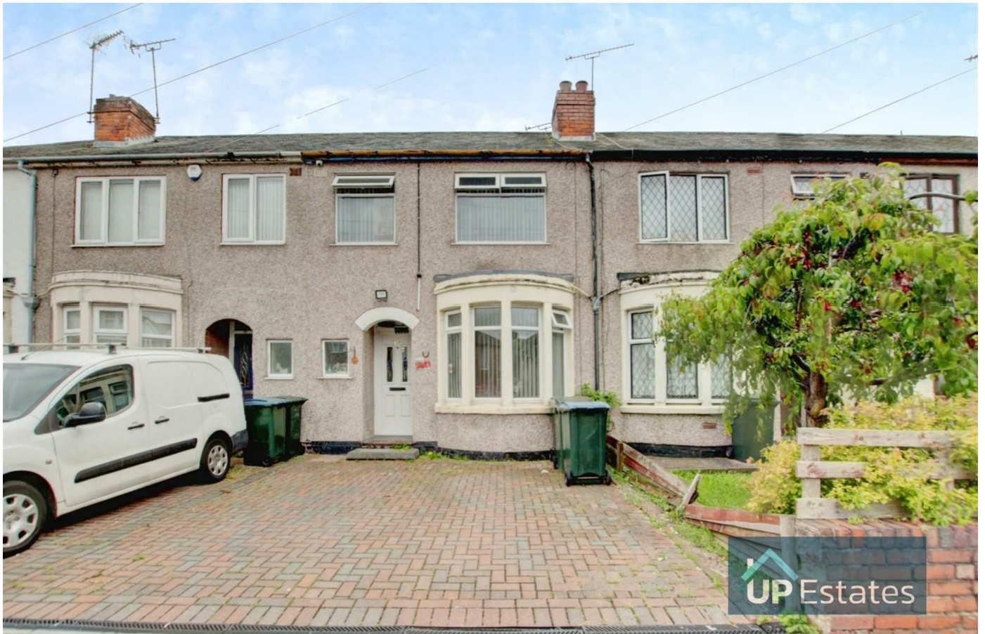
Dunster Place, Coventry