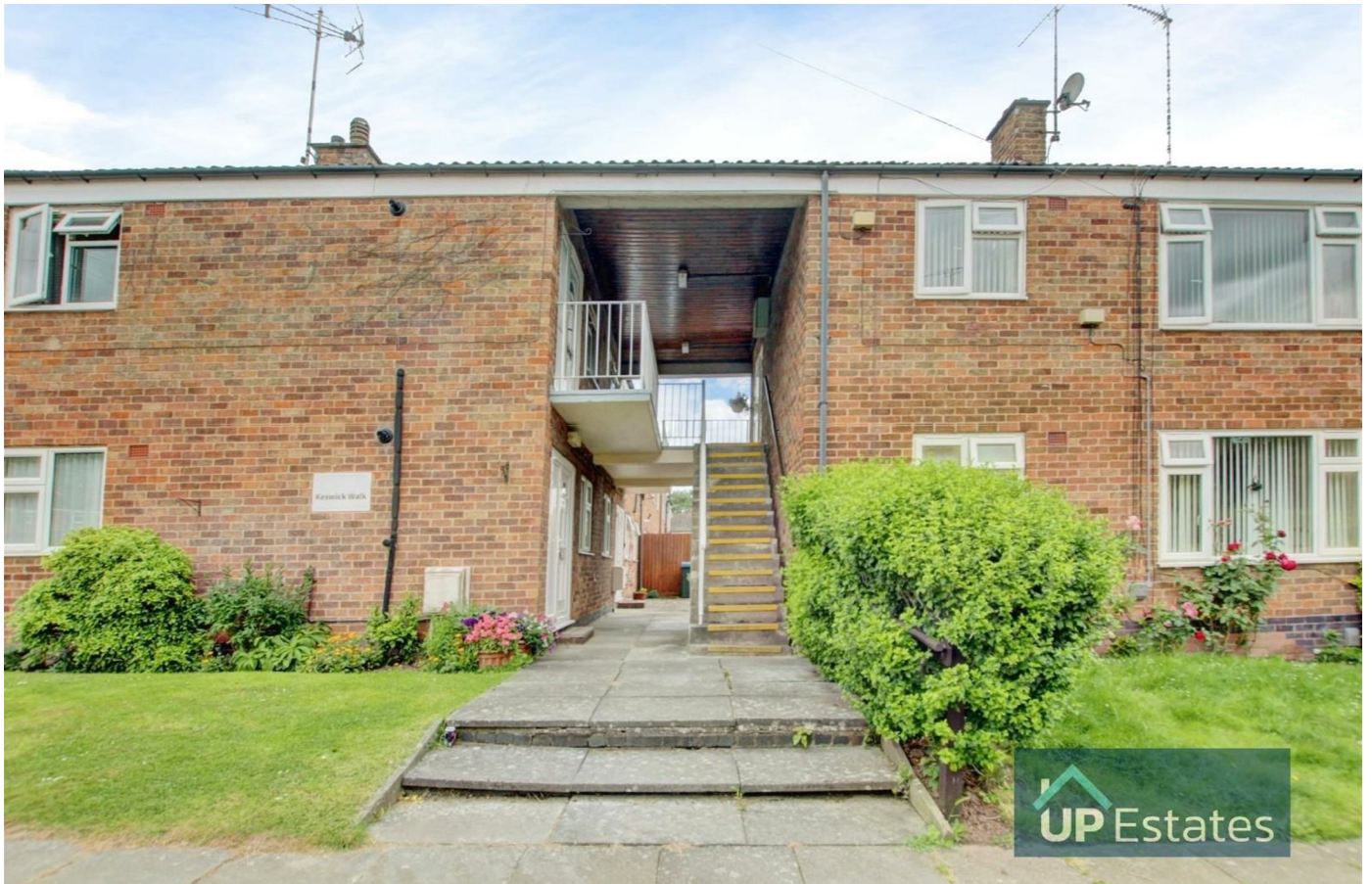
Keswick Walk, Coventry