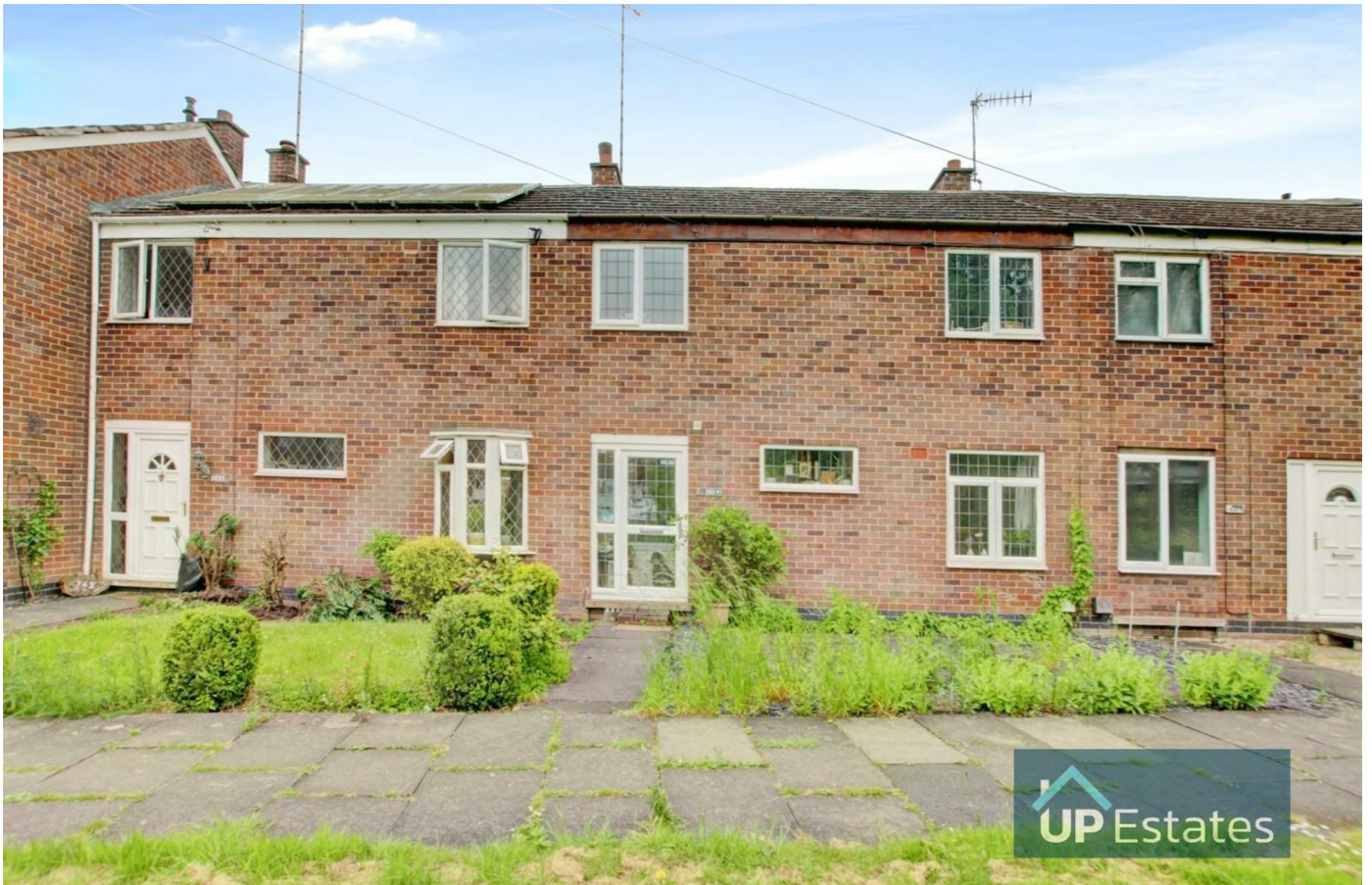
Fenside Avenue, Coventry