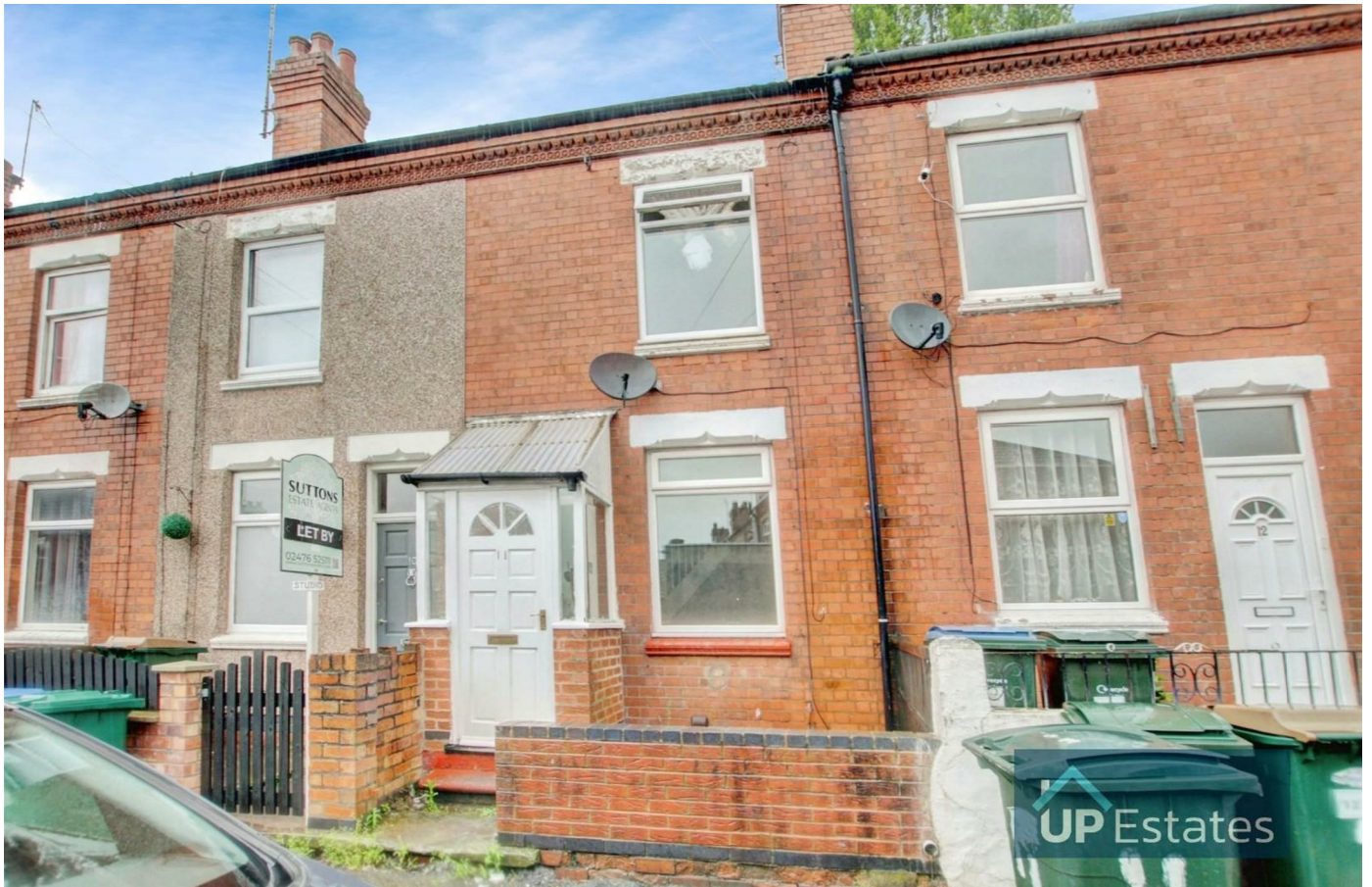
Newnham Road, Coventry