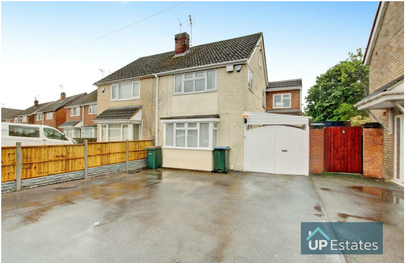
Yewdale Crescent, Coventry