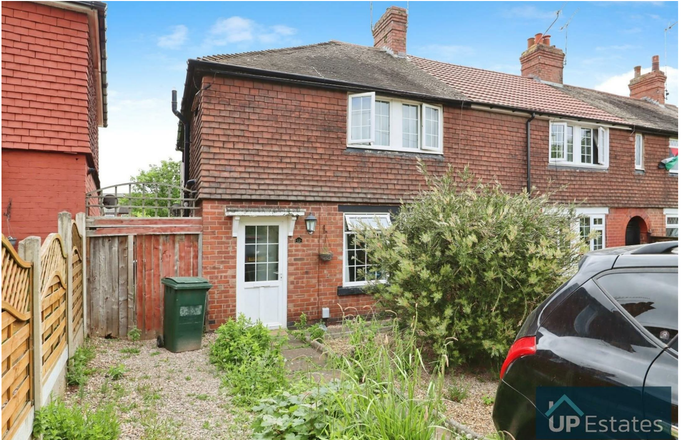
Lodge Road, Coventry