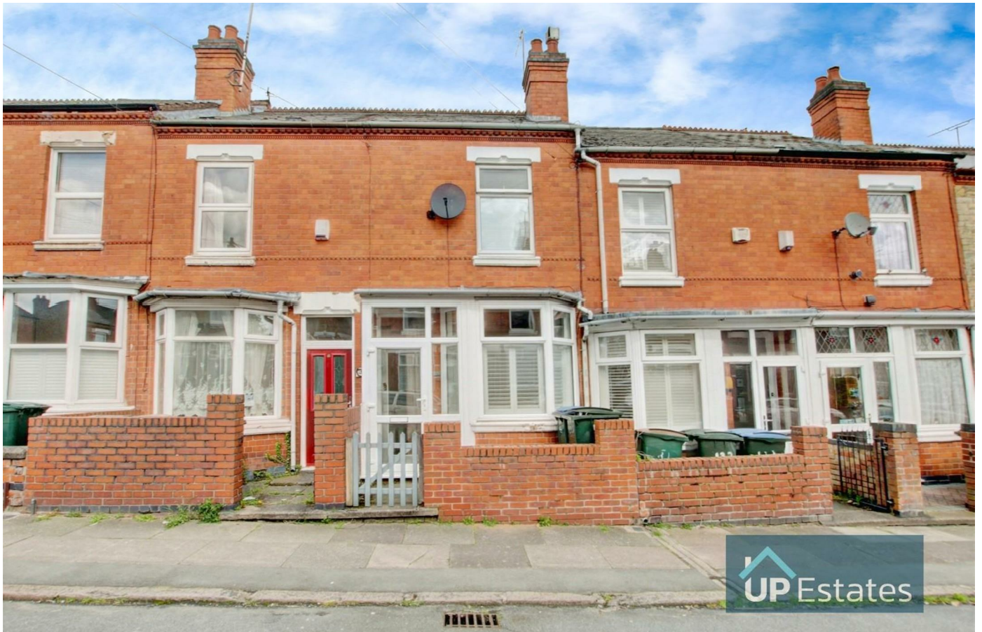
Sovereign Road, Coventry