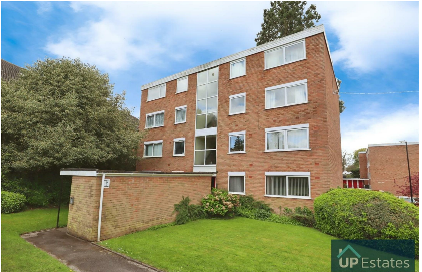
Bankside Close, Coventry