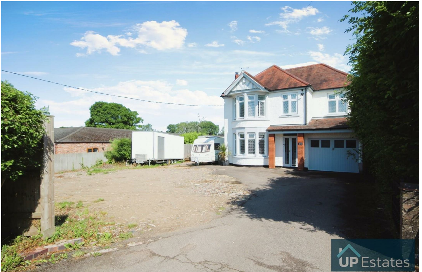
Hawkes Mill Lane, Allesley, Coventry