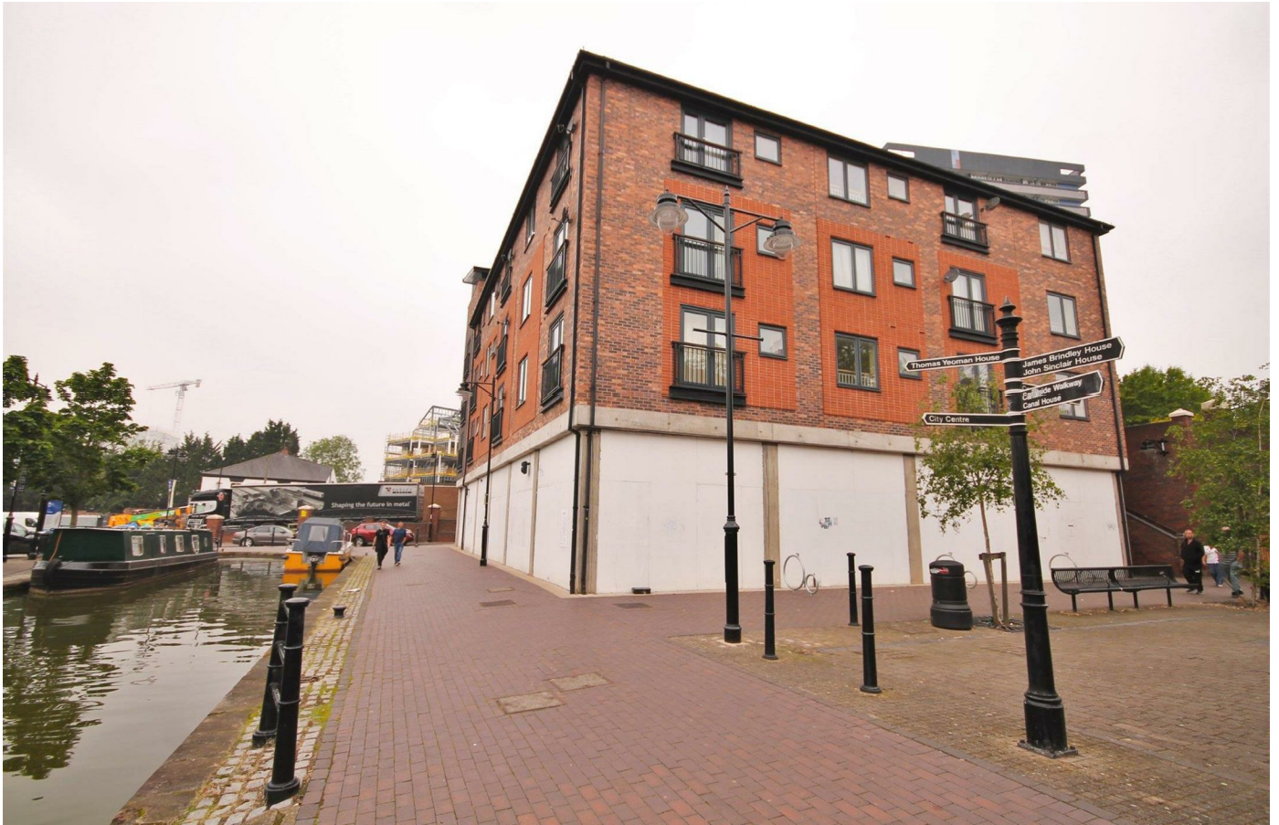
St. Nicholas Street, Coventry