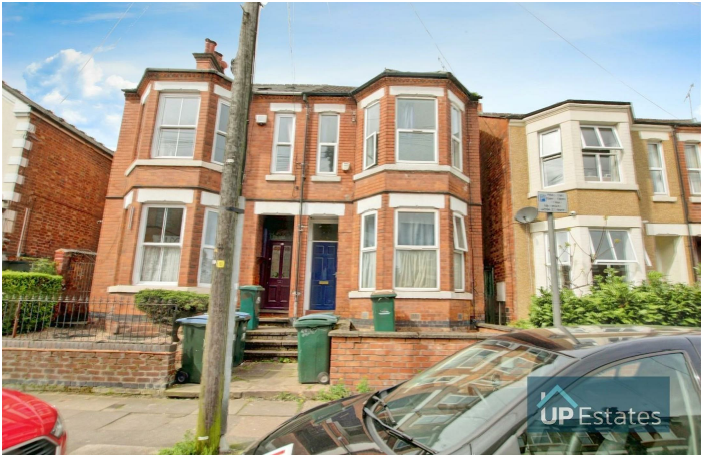
Albany Road, Coventry