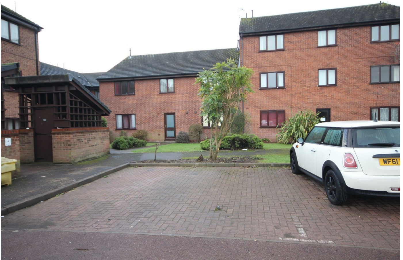
Lansdowne Street, Coventry