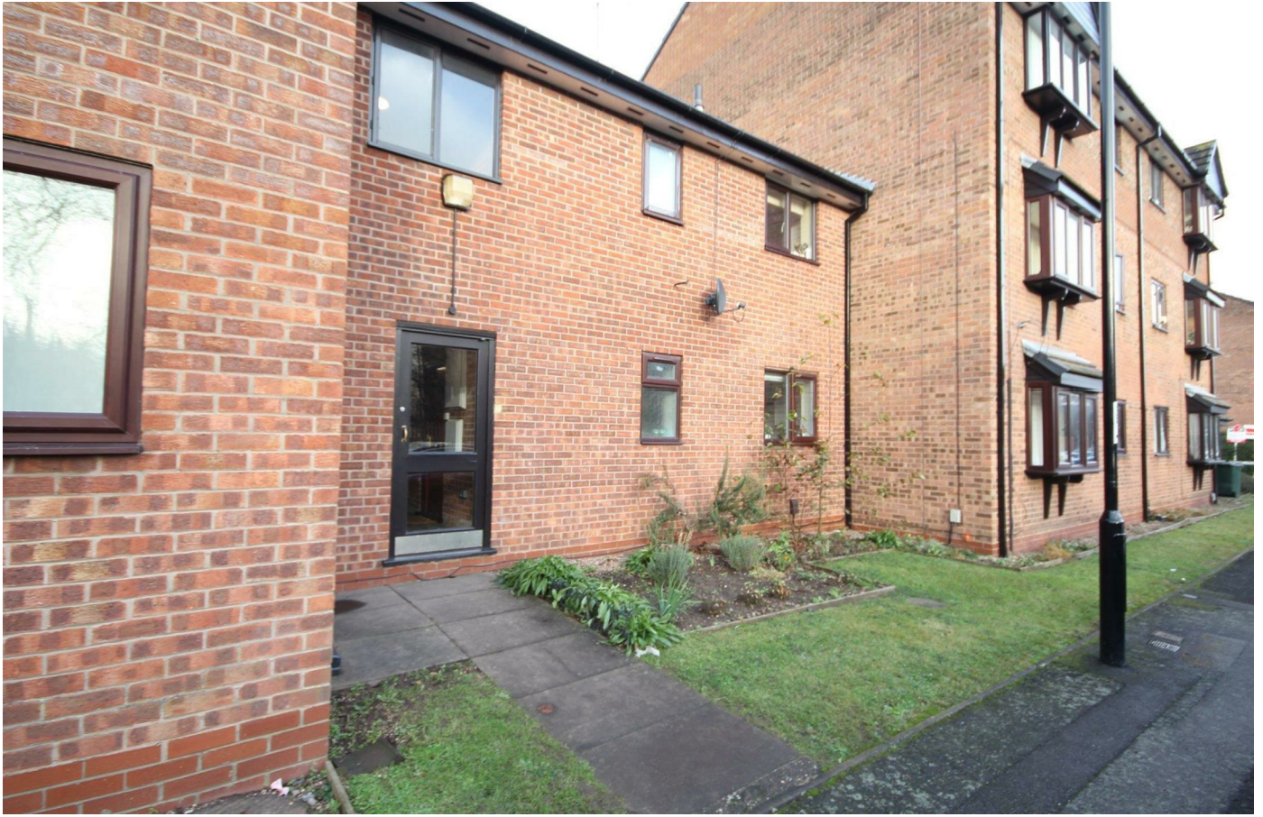
Lansdowne Street, Coventry