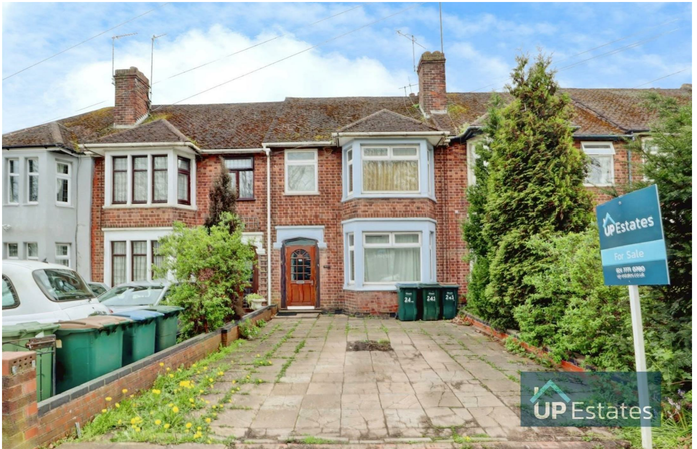
Holyhead Road, Coventry