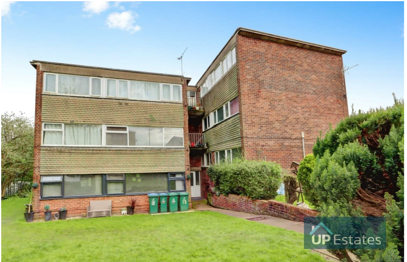
Crathie Close, Coventry