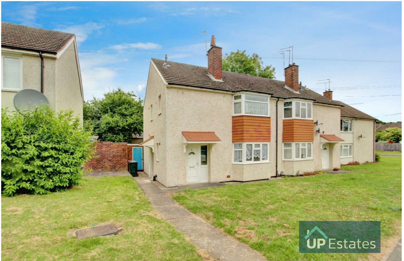
Frisby Road, Coventry