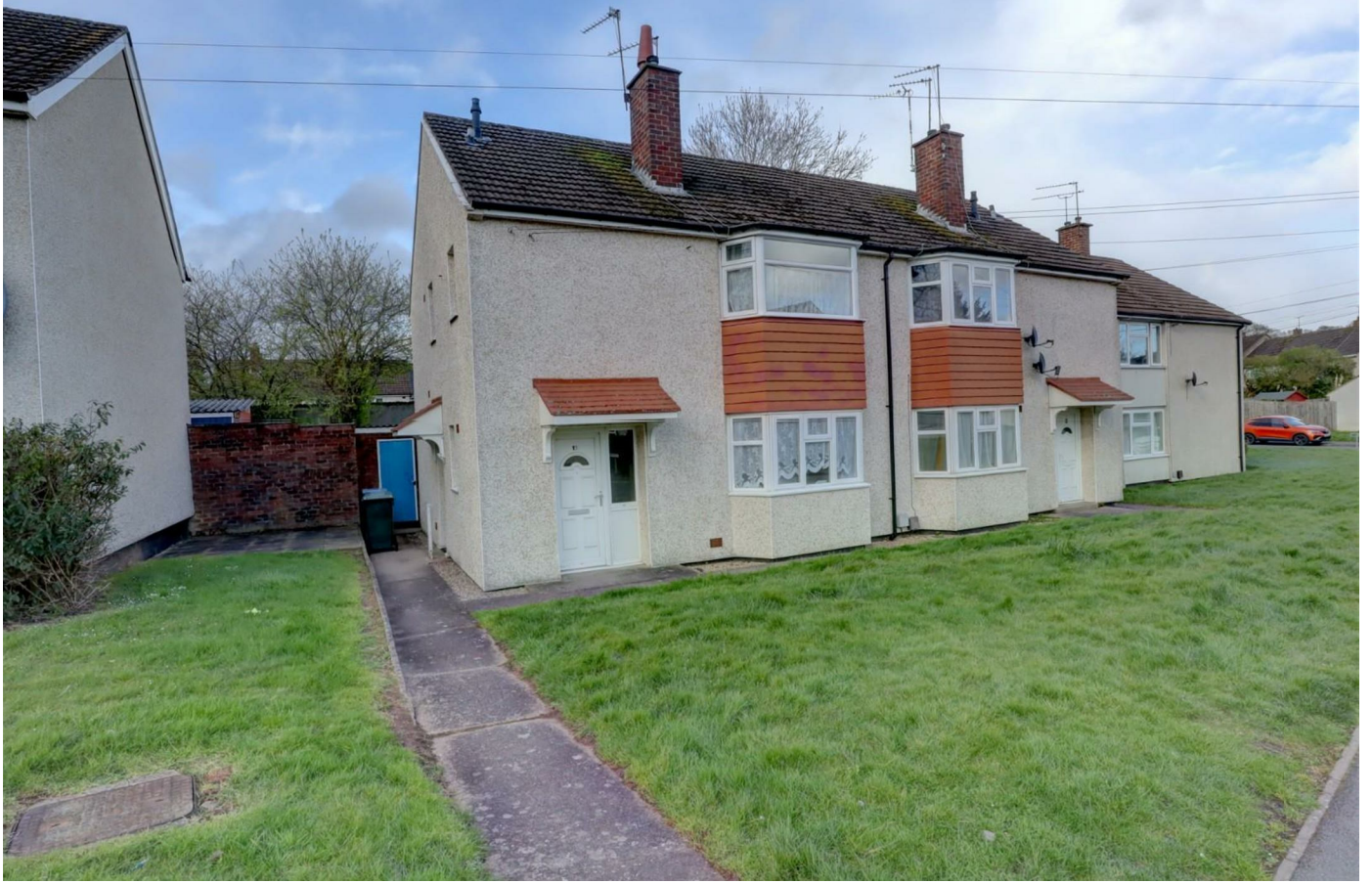
Frisby Road, Coventry