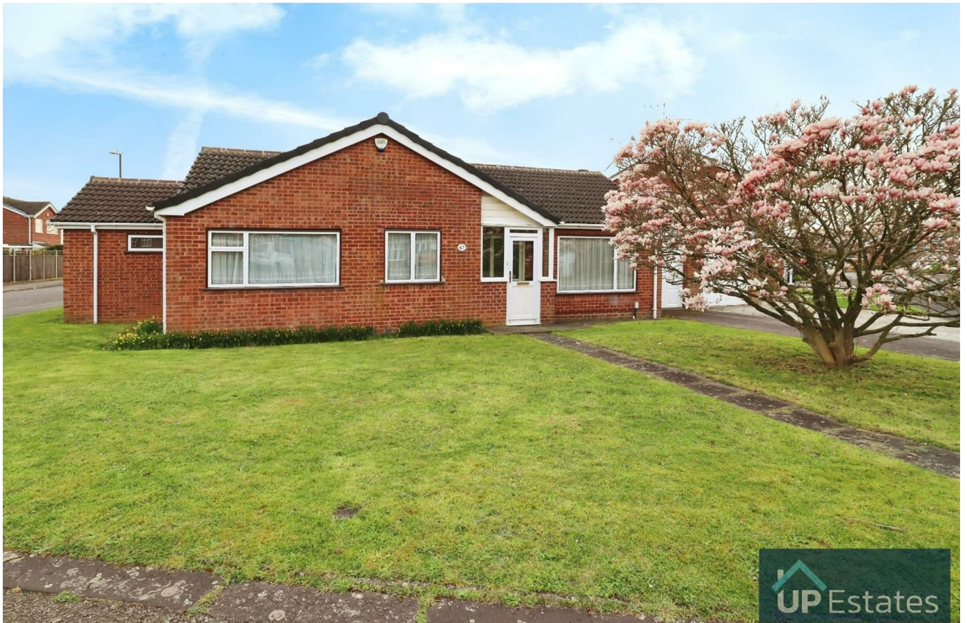
Garth Crescent, Binley, Coventry