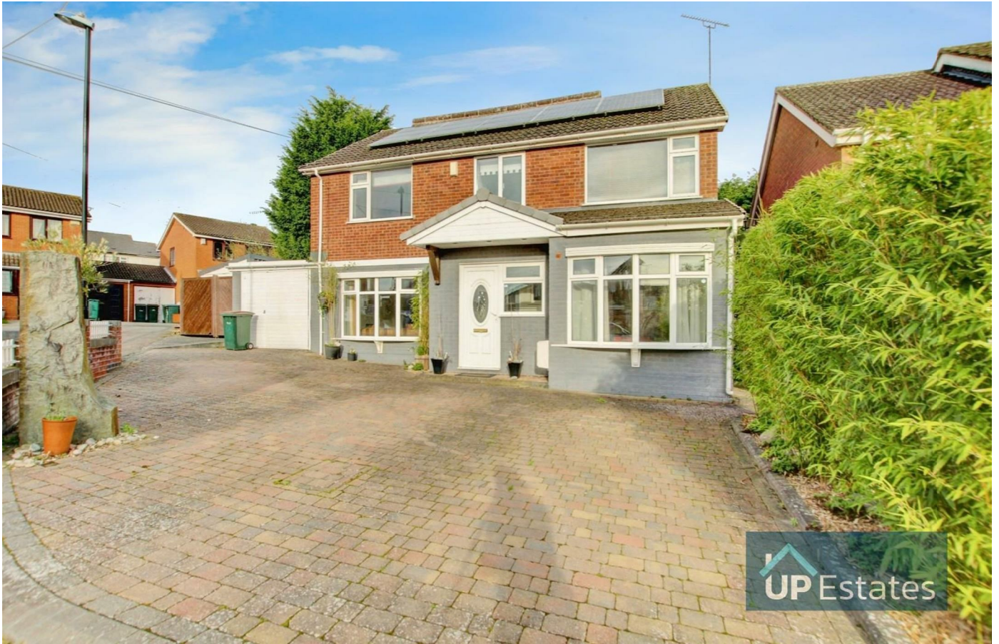
Osbaston Close, Coventry