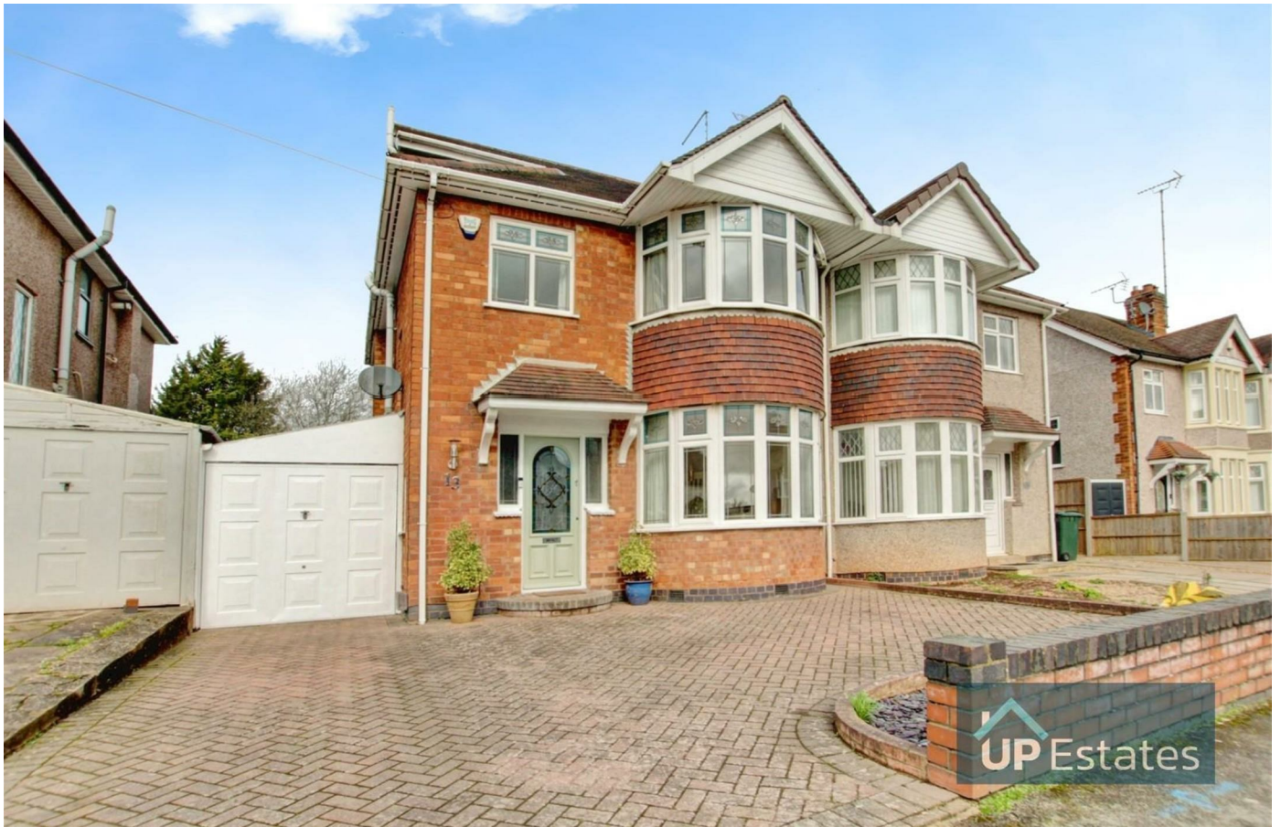
Watercall Avenue, Coventry