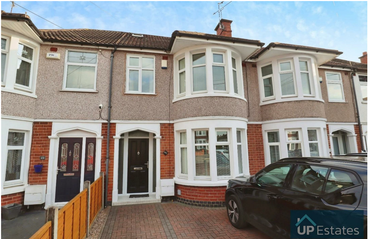
Kelmscote Road, Coventry