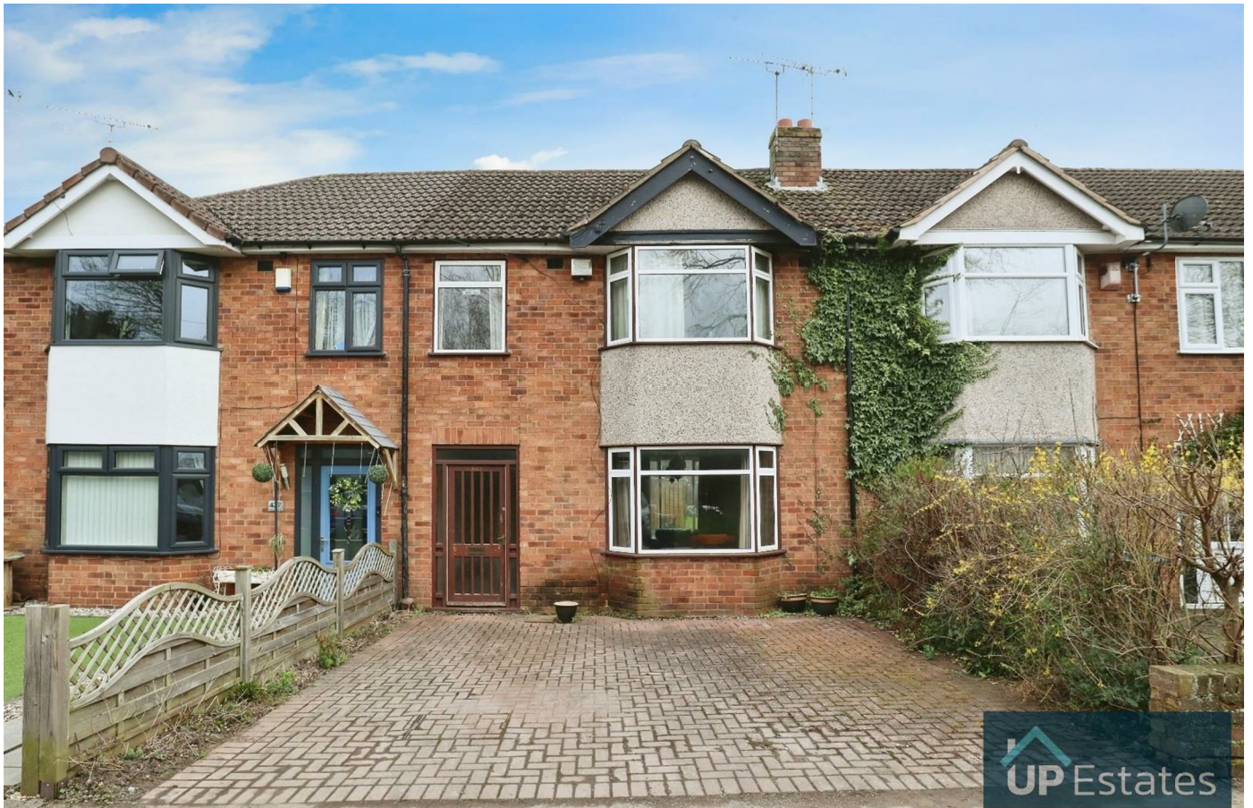
Binley Road, Binley, Coventry