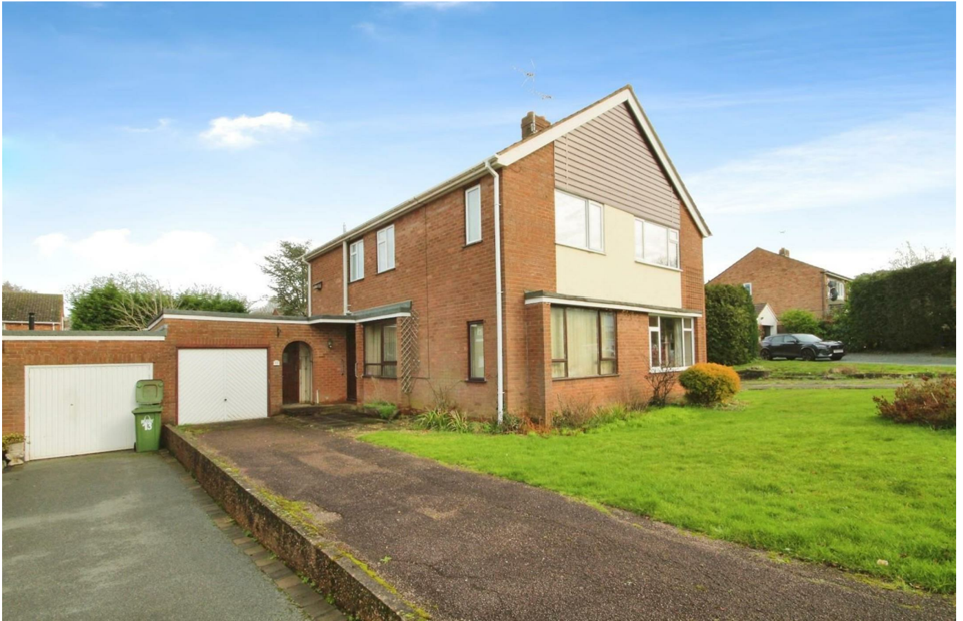
Court Leet, Binley Woods