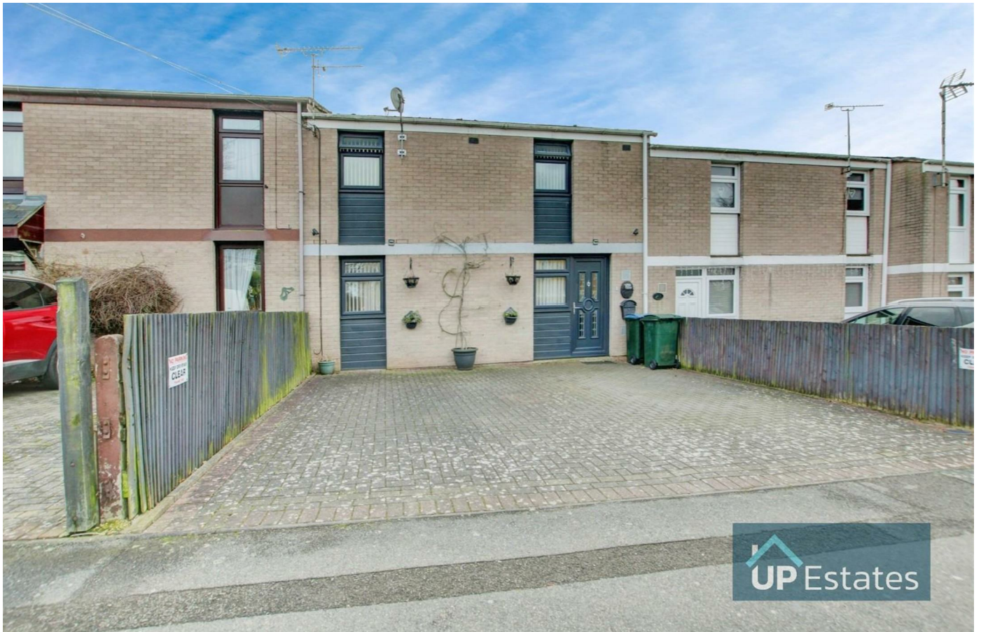
William Mckee Close, Binley, Coventry