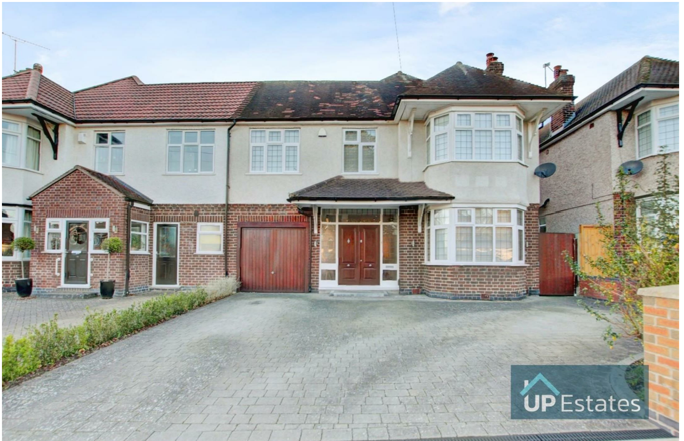
Asthill Grove, Coventry