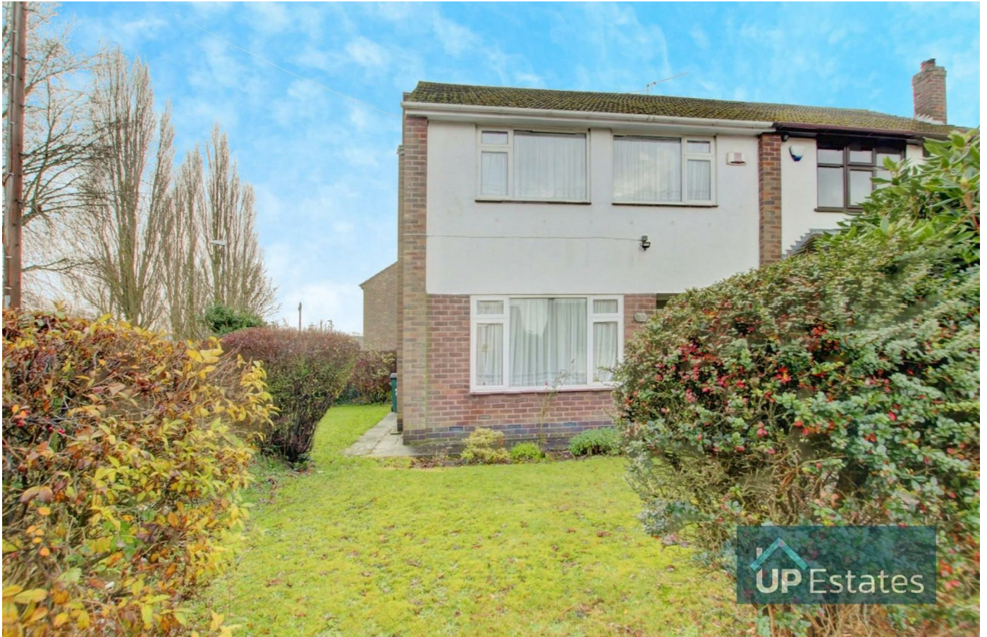
Haselbech Road, Binley, Coventry