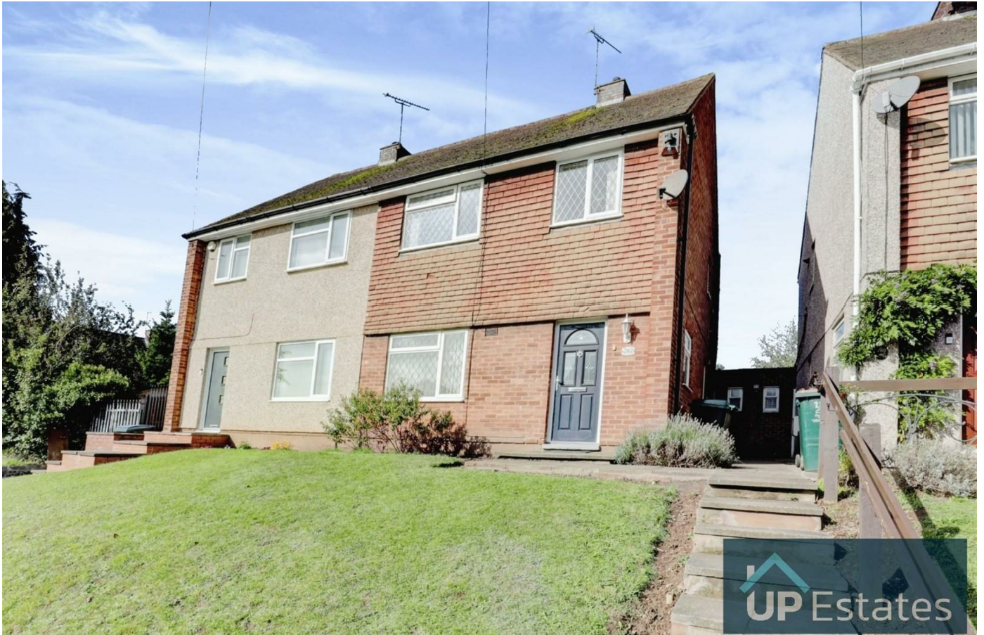
Tennyson Road, Coventry