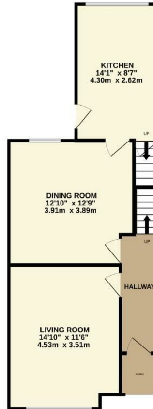
GROUND FLOOR 544 sq.ft. (50.5 sq.m.) approx.