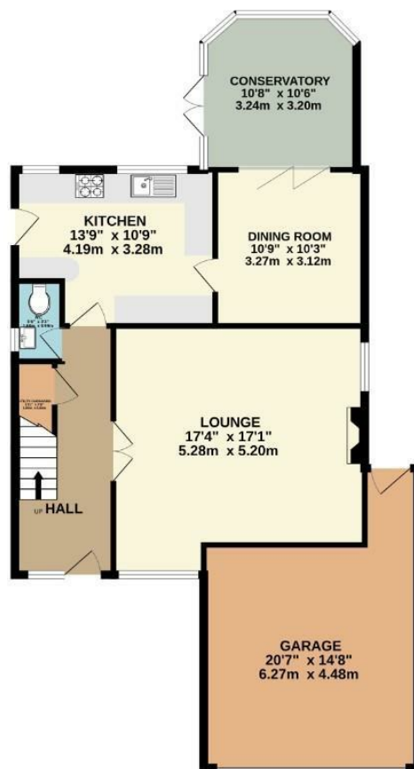
GROUND FLOOR 993 sq.ft. (92.3 sq.m.) approx.