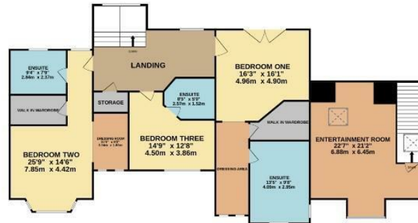
1ST FLOOR 1881 sq.ft. (174.8 sq.m.) approx.