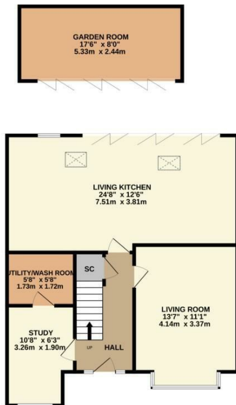
GROUND FLOOR 799 sq.ft. (74.2 sq.m.) approx.