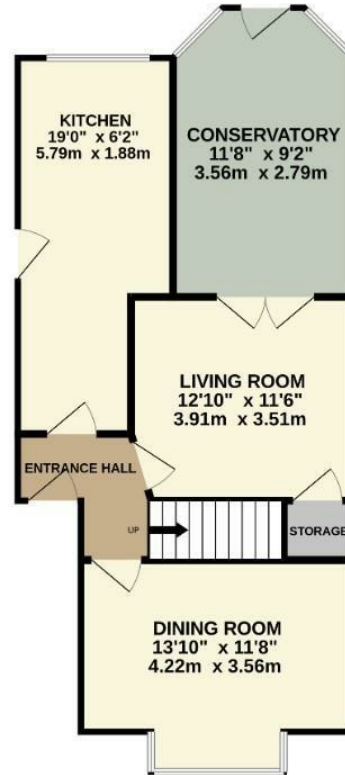
GROUND FLOOR 571 sq.ft. (53.0 sq.m.) approx.