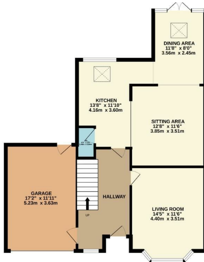
GROUND FLOOR 828 sq.ft. (76.9 sq.m.) approx.