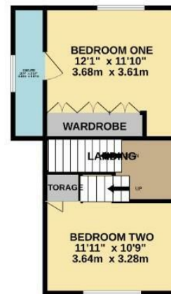
2ND FLOOR 105 sq.ft. (9.8 sq.m.) approx.