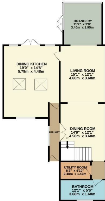
GROUND FLOOR 909 sq.ft. (84.5 sq.m.) approx.