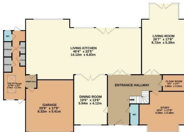
GROUND FLOOR 3040 sq.ft. (282.4 sq.m.) approx.