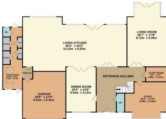
1ST FLOOR 2435 sq.ft. (226.2 sq.m.) approx.