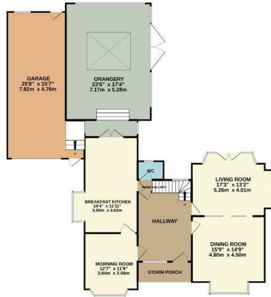
GROUND FLOOR 1827 sq.ft. (169.7 sq.m.) approx.