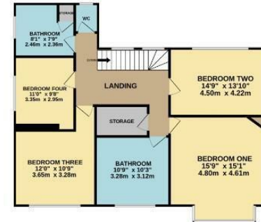
1ST FLOOR 985 sq.ft. (91.5 sq.m.) approx.