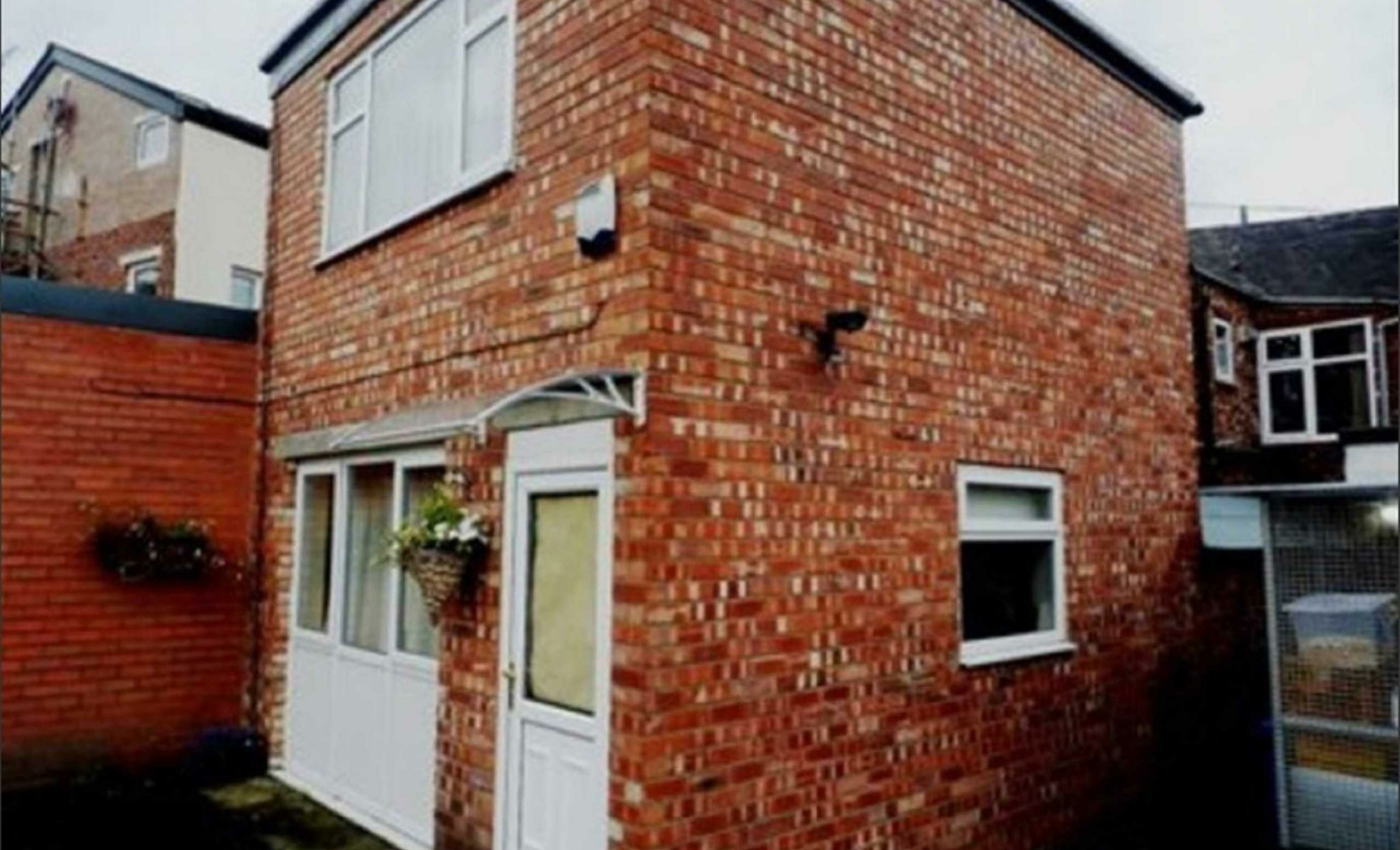
The Rear Flat, 11a Woodford Road, Bramhall, Cheshire, SK7 1JN